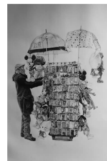
Totem - view -