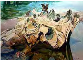
the preacher on the shore, st govans | after the flood 1