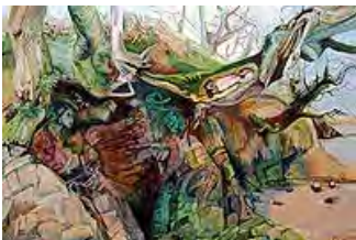
the spectators, wisemans bridge | the cave, lawrenny