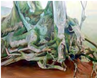
tree roots 1, Ilangadog On The Stairs, GALE LEWIS [below]