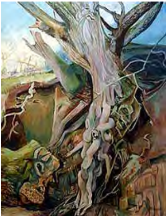
erosion | andromeda, lawrenny